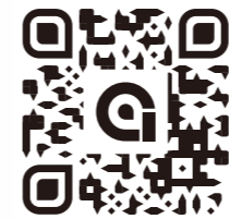
Actual Print Size